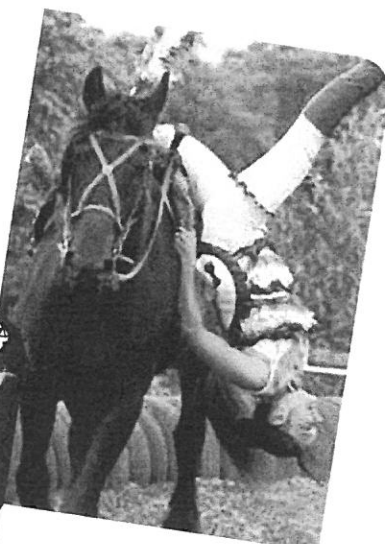
LIBERTY HORSE and TRICK RIDER

The Les Amis Team specialise in providing highly skilled, professional performances to thrill and entertain audiences of all ages. The name means "The friends of Onno". Onno was one of the founding horsey members of the troupe!