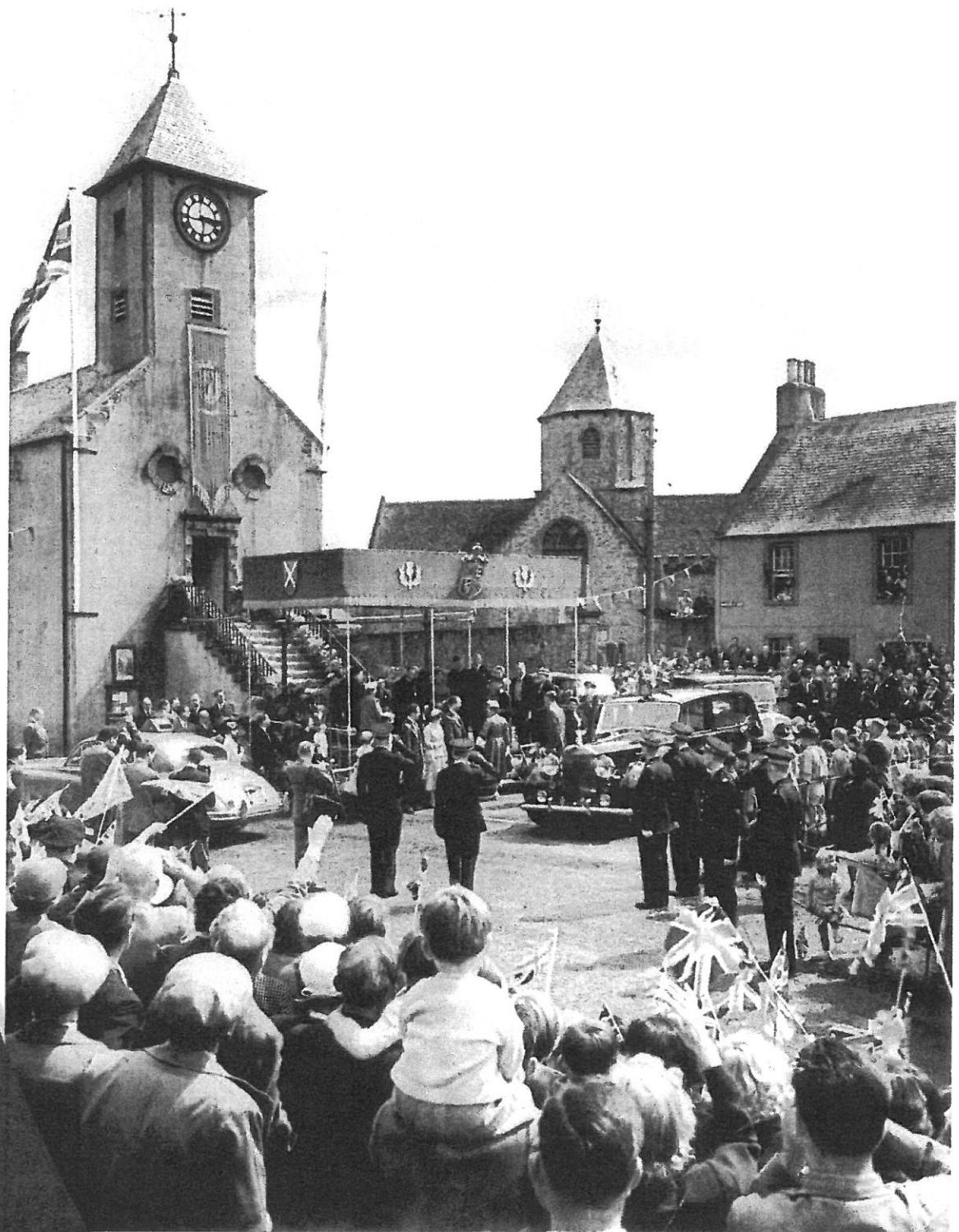
As part of a Royal visit to Berwickshire in 1956, three years after her coronation, the Queen went on a tour around the county, including her first visit to the Royal and Ancient Burgh of Lauder